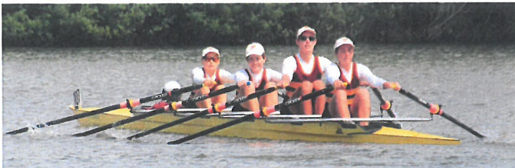
Shepparton – State champions in March 2019 – Mens D quad sculls