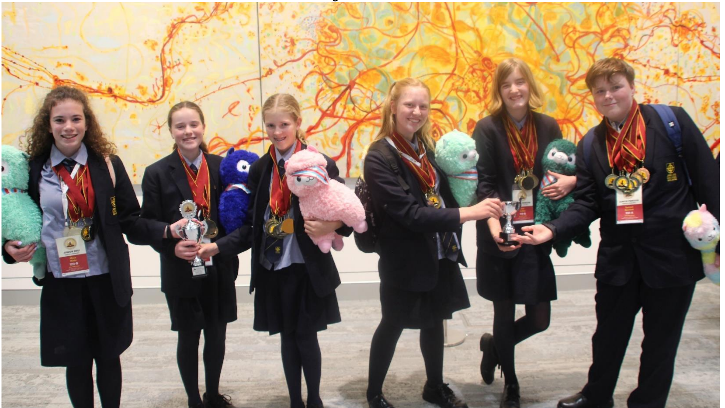
Junior teams with prizes and Alpacas after their awards presentations