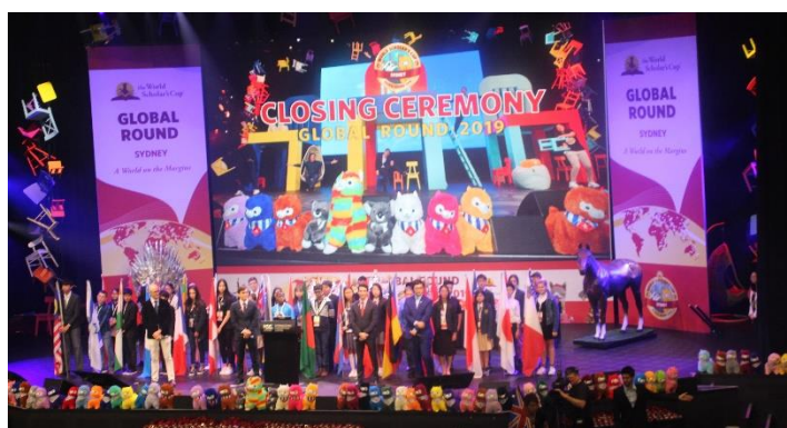
The closing ceremony - Juniors