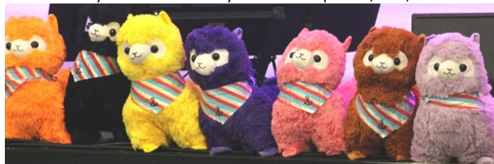
Alpacas were everywhere of course!