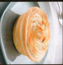
Shepherd's Pie Marking: Potato Allergens: contains Gluten, Milk and Soy. May contain Egg and Sesame.