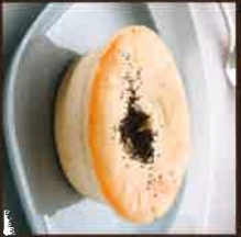
Beef & Mushroom Pie Marking – Poppy Seed Allergens – contains Gluten, Milk and Soy. May contain Egg and Sesame.