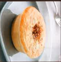
Beef & Red Wine Pie Marking: Paprika & Sesame Allergens: contains Gluten, Milk, Soy and Sesame. May contain Egg.