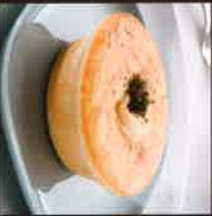
Chunky Angus Beef Pie Marking: Parsley Allergens: contains Gluten, Milk and Soy. May contain Egg and Sesame.