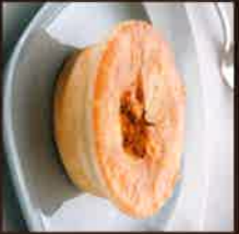
Beef & Curry Pie Marking: Curry Powder Allergens – contains Gluten, Milk and Soy. May contain Egg and Sesame.