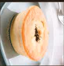
Thai Chicken Pie Marking: Paprika, Parsley, Poppy & Sesame Allergens: contains Gluten, Milk, Soy, Sesame & Cuscuta. My contain Egg.