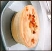
Beef, Bacon & Cheese Pie Marking: Cheese Allergens: contains Gluten, Milk and Soy. May contain Egg and Sesame.