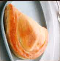
Vegetable Pastie Marking: D-shape fold Allergens: contains Gluten, Milk and Soy. May contain Egg and Sesame.