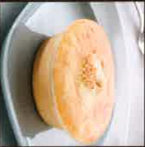
Chicken & Vegetable Pie Marking: Sesame Seed Allergens: contains Gluten, Milk, Soy and Sesame. May contain Egg.