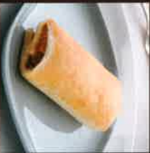
Sausage Roll Marking: Puff Pastry Roll Allergens: contains Gluten, Milk, Soy and Sulphites. May contain Egg and Sesame.