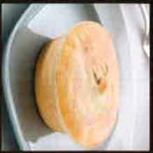
Aussie Beef Pie Marking: Plain Puff Pastry Top Allergens: contains Gluten, Milk and Soy. May contain Egg and Sesame.