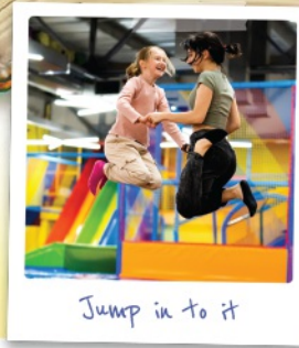
Jump in to it