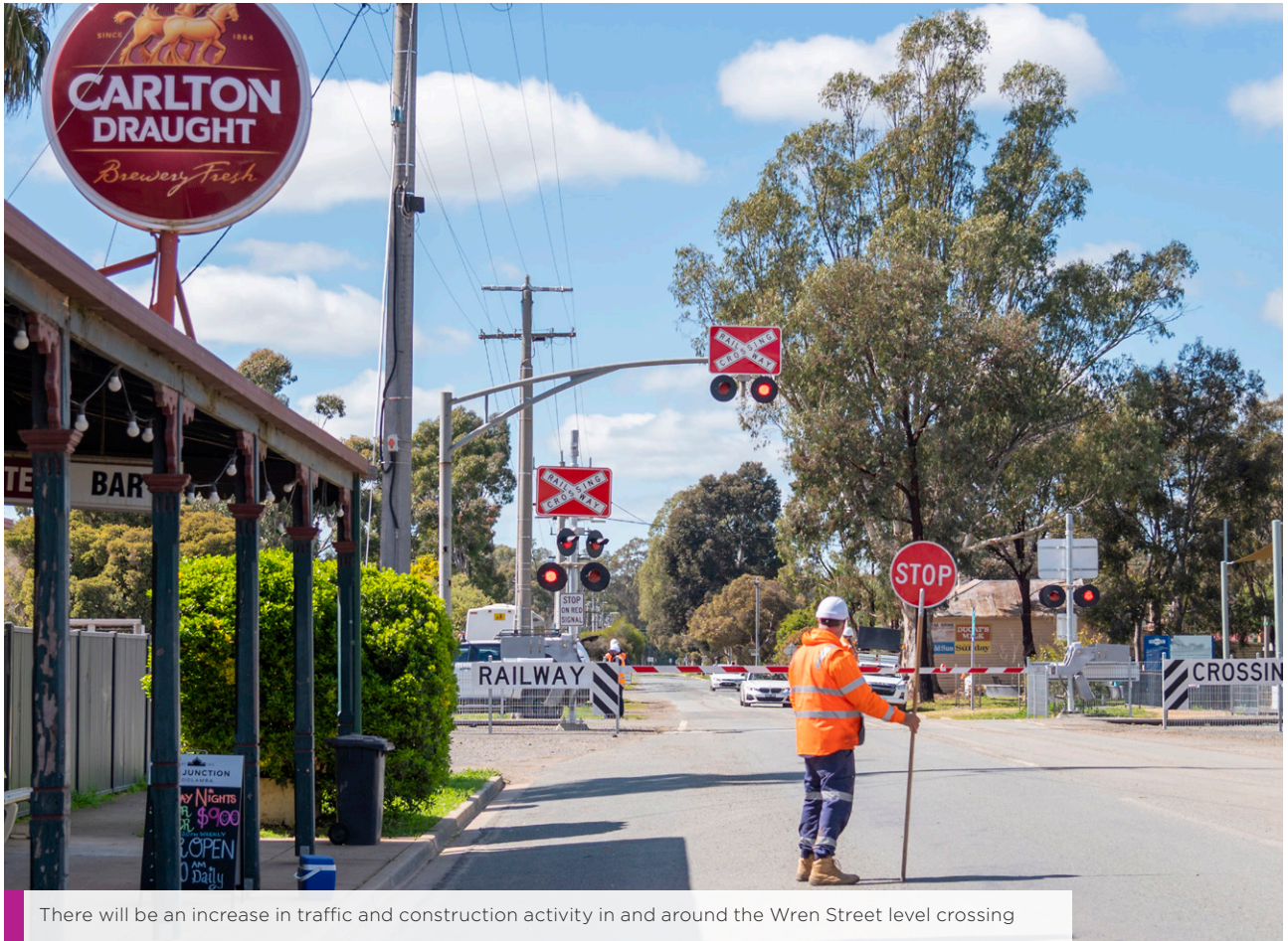
There will be an increase in traffic and construction activity in and around the Wren Street level crossing

You can call 1800 105 105 (24 hours a day, 7 days a week) for more information.