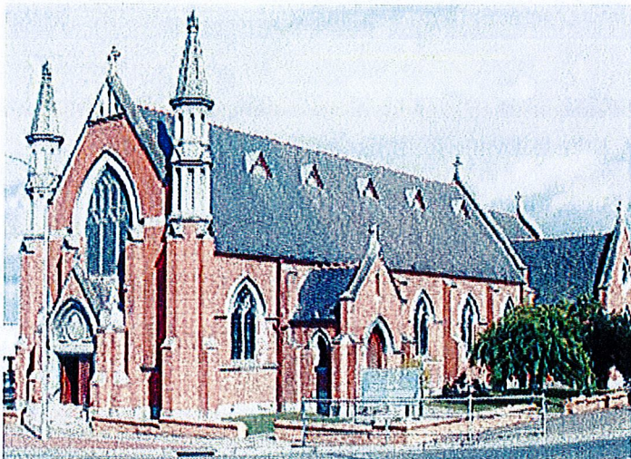
St Nicholas Church - East Tamworth