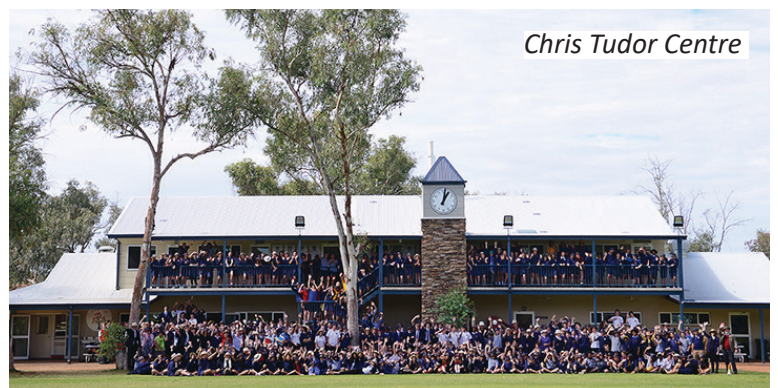
Chris Tudor Centre