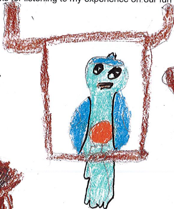
orange belly parrot