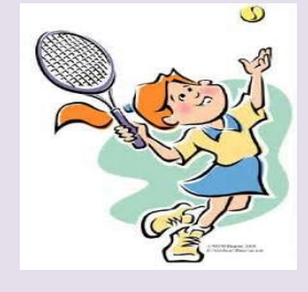
Enjoy the day having a game of tennis with your friends at the Mellor Park