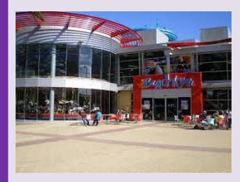
Enjoy spending the day having fun with your friends at the Beachouse