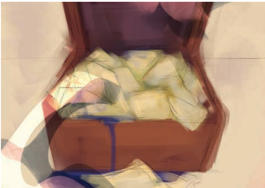
xxx Sonya Kalinina

undertake subject extension work (such as EE, CAS, extra lectures, work experience, organising events, supporting Lower School students), and be an advocate for the subject in and out of the classroom.