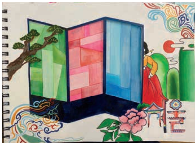
xxx Jimin Son

50,000CZK has been made available each year to be distributed in an ad hoc manner to any existing students who show exceptional talent in a certain area. Last year we have decided to double this amount and to support 10 students and their special talents. The reason is simple: at a time when all our activities have been restricted, we need to support as much as possible the potential of our talented students.