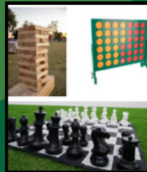
GIANT, JENGA, CHESS & CONNECT FOUR