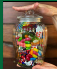
GUESS THE LOLLIES IN THE JAR