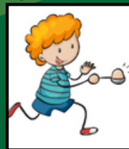
EGG AND SPOON RACE