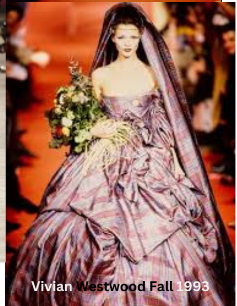
Vivian Westwood Fall 1993