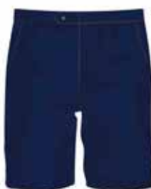
SHORTS FLY FRONT STYLE