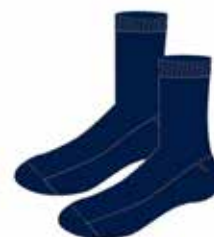
NAVY ACADEMIC SOCKS