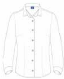
GIRL'S LONG SLEEVE BLOUSE