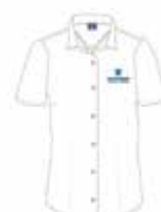
GIRL'S SHORT SLEEVE BLOUSE