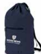
PE/SWIMMING HAVASAK BAG