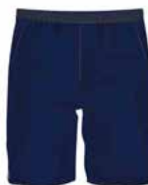
SHORTS FULL ELASTICATED