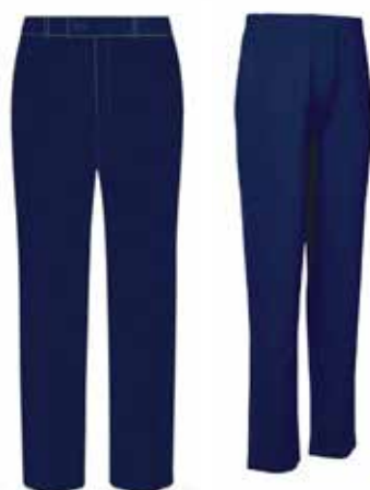
TROUSERS PLEATLESS TROUSERS DOUBLE KNEE