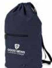
PE/SWIMMING HAVASAK BAG