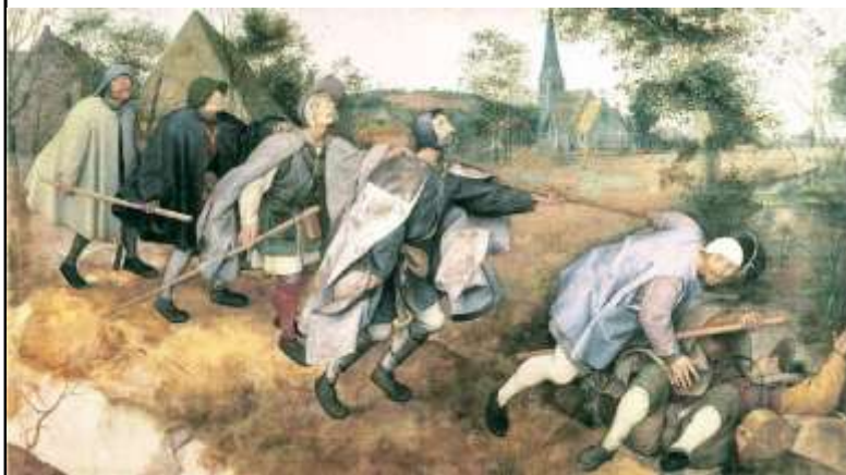
Pieter Bruegel the Elder - The Blind Leading the Blind