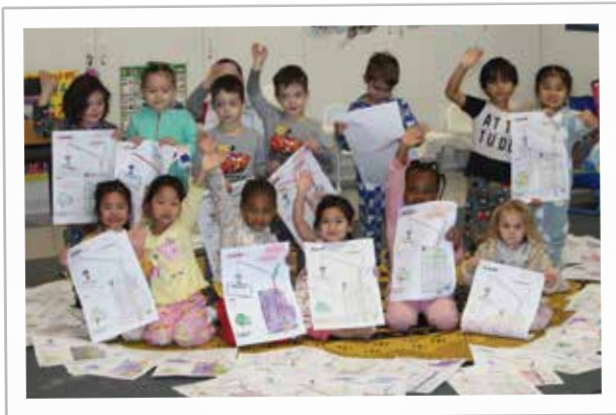
Northern Bay College kindergarten children enjoyed Pyjama Day in conjunction with their participation in a competition to name the crane being used on the GMHBA construction site in Geelong CBD. The pyjama-clad children show off their entries.