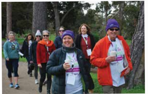
Geelong residents are invited to participate in 27forParkinson's during October to raise awareness and funds for research into Parkinson's disease. The month-long activity replaces the annual Walk In The Park and is encouraging people to get out and move at their own pace and walk 27 times, over 27 days in October.