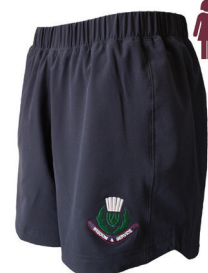
Sport Shorts with Inner