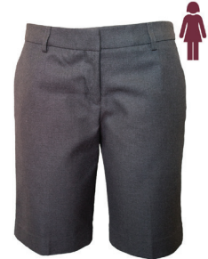
Grey Shorts Tailored