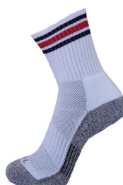
Sports Sock 2 pkt