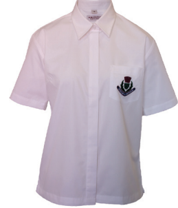
Short Sleeve Blouse