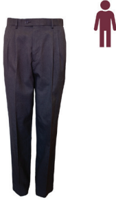
Trouser Pleat front Grey