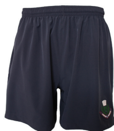
Sport Shorts Unisex