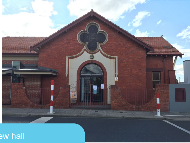
OSHCLUB at the new hall