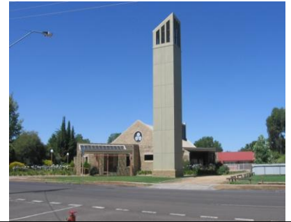
St Joseph's Cobram 6-8 William Street PO Box 424 Cobram, Vic 3644