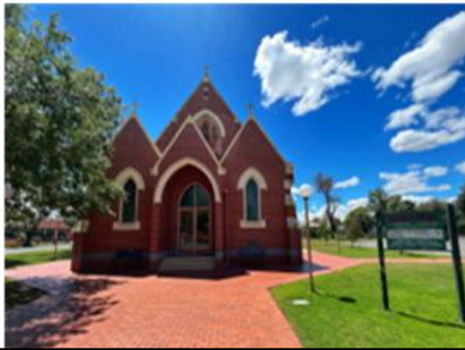
Sacred Heart, Yarrowonga Cnr Murphy & Witt Streets PO Box 36, Yarrowonga Vic 3730