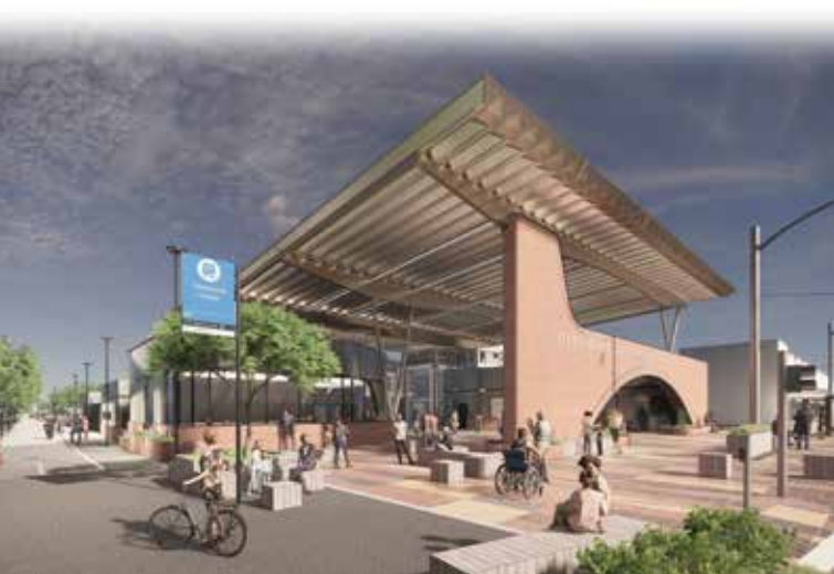
The new Glenhuntly Station. Artist impression, subject to change.

These two dangerous and congested level crossings have been fast-tracked for removal, with early construction works underway to remove the boom gates by 2023 and finish the job in 2024 – one year ahead of schedule.