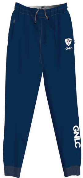
PE Track Pants (P-12)