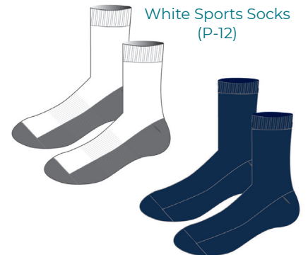
White Sports Socks (P-12)