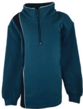
Fleece Jumper (P-6)