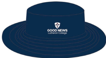
Hybrid Hat (P-12)