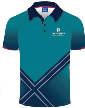
PE Sports Polo (7-12)