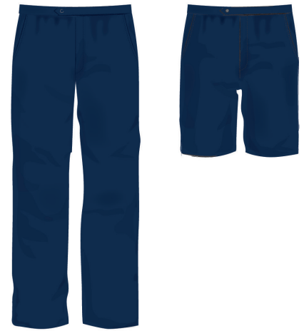
Unisex Pants & Shorts (P-6)