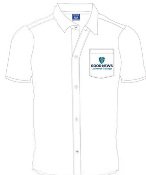
Boys Short Sleeve Shirt (7-12)