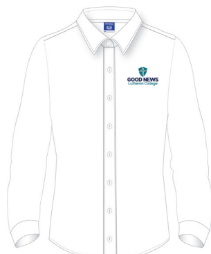
Girls Long Sleeve Shirt (7-12)