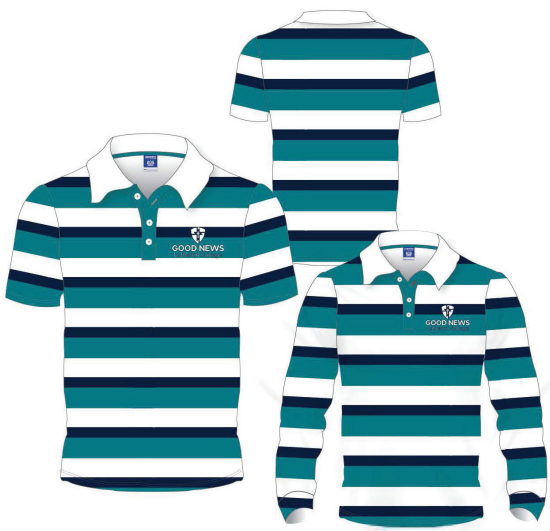
Striped polo (P-6)