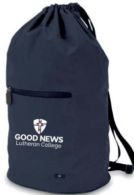
PE Havasak Bag (P-12)