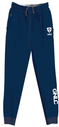
PE Track Pants (P-12)