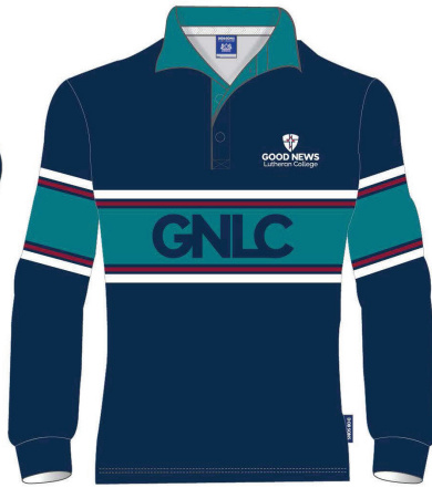
PE Rugby Top (7-12)