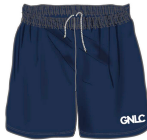
PE Unisex Sport Shorts (P-12)