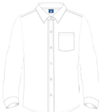
Boys Long Sleeve Shirt (7-12)