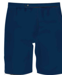
Boys Pants & Shorts (7-12)