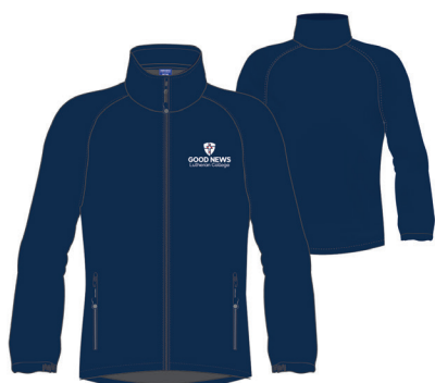
Soft Shell Jacket (P-12)