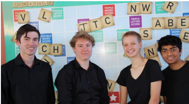
Above -Creative Edge 2019 team