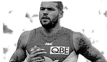
Lance Franklin Indigenous AFL Player