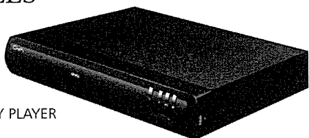
BLU RAY PLAYER