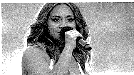
Jessica Mauboy Indigenous Recording Artist