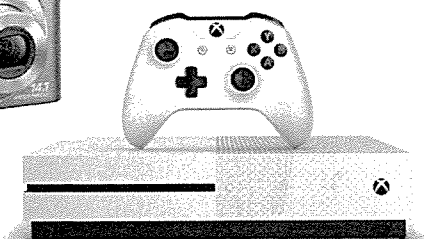
XBOX ONE S AND GAMES