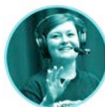
Be heard on the ABC!

The Heywire competition is open to people aged 16 – 22, to submit a story about life in regional Australia. Your story can be created in any form of media: text, video, photography, or audio. If you are selected as one of the winners, your story will be featured on ABC Local Radio, ABC Radio National, ABC TV and abc.net. Entries close 16 September, www.abc.net.au/heywire