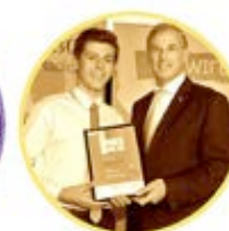
Make a difference!