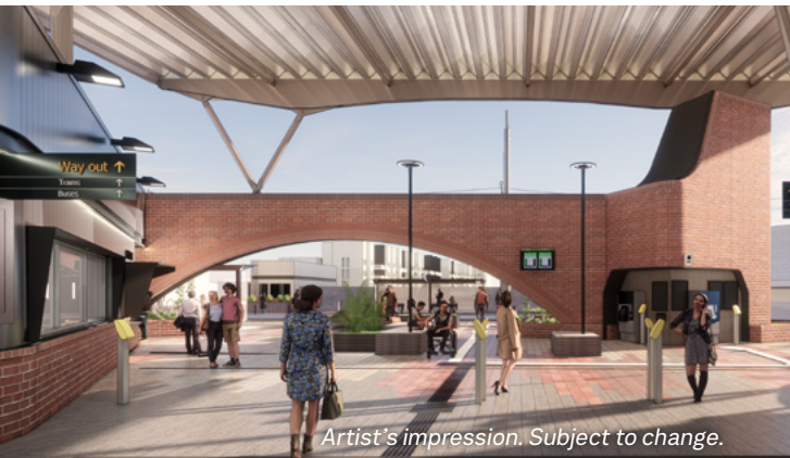
Artist's impression. Subject to change.