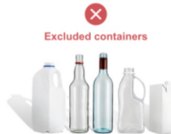
✗ Excluded containers

There are some drink containers that are not eligible for a refund. Generally, excluded containers are those that are less than 150ml and greater than 3L.